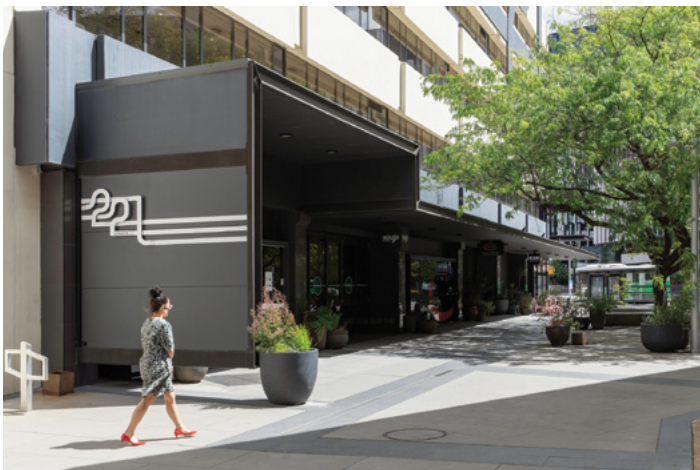
221 London Circuit

UNHCR promotes and protects the legal rights of refugees in the Australia and Pacific region.