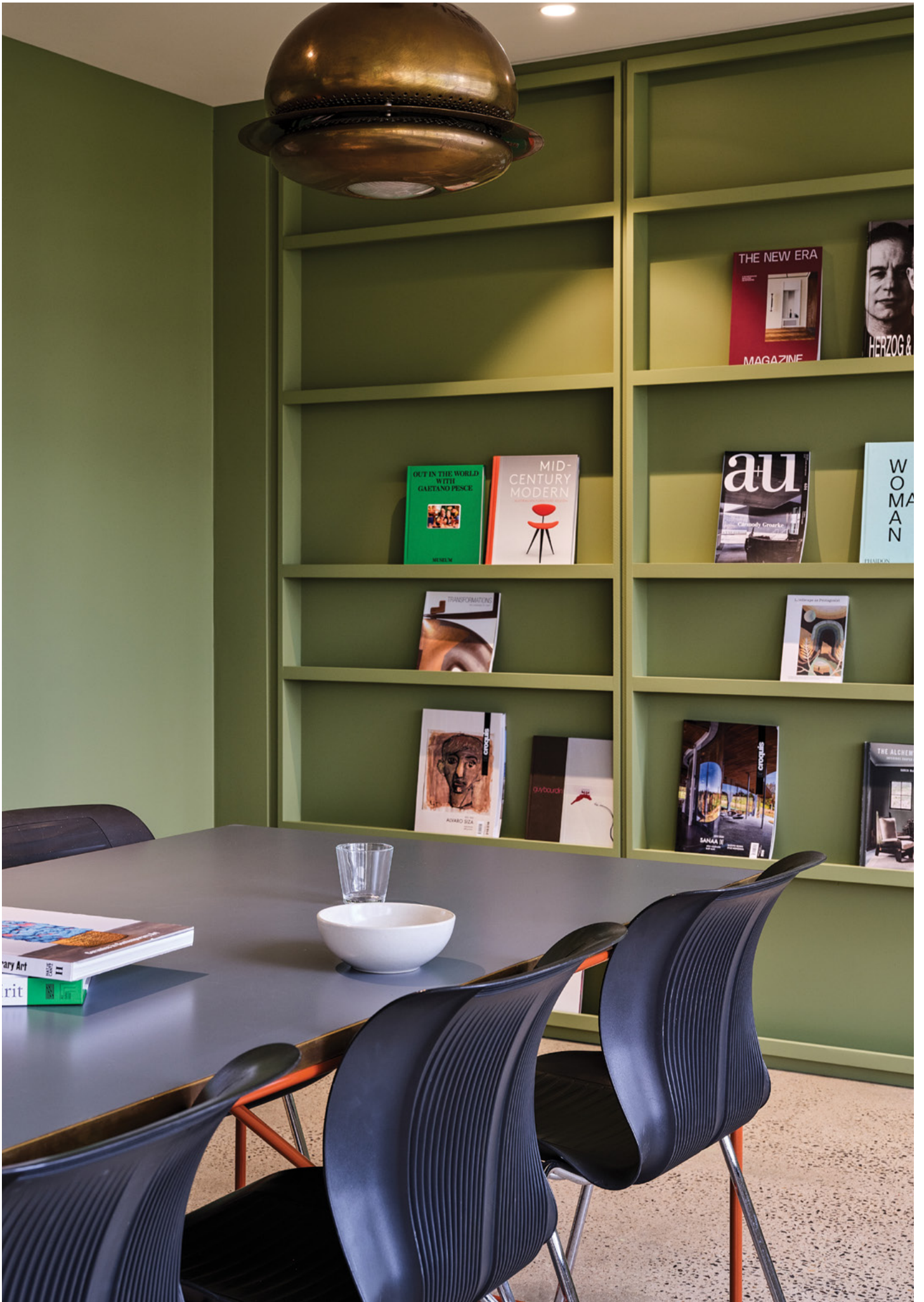
Level 3 workspaces, 221 London Cct