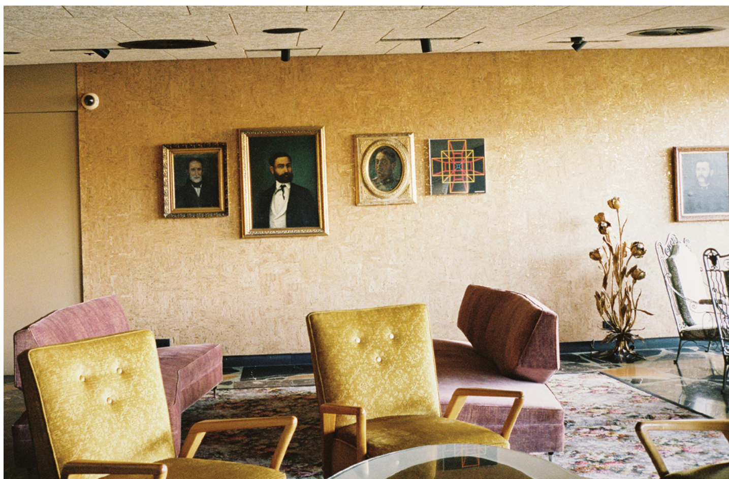
Monster Kitchen and Bar

Zaab 2/9 Lonsdale Street Trendy eatery in a sleek setting serving Southeast Asian dishes with a twist, plus cocktails and beer.