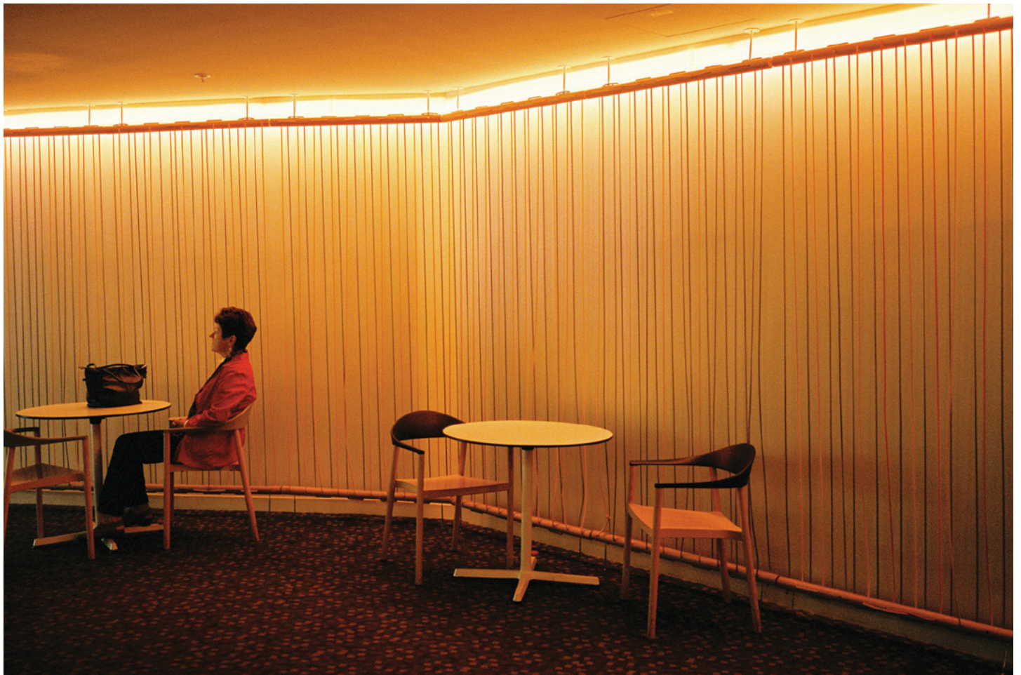
Palace Electric Cinemas

Palace Electric features eight fully licensed cinemas and a stunning Prosecco bar for you to indulge in both pre- and post-film.