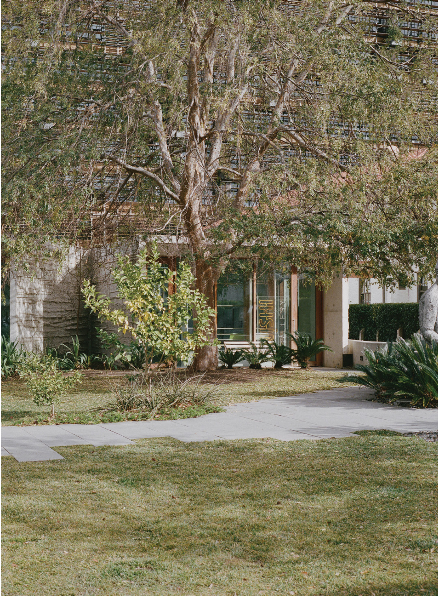
John Avery Gardens and NewActon Pavilion.